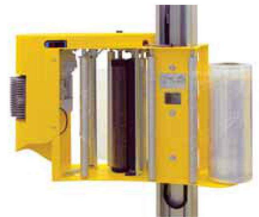
The Power Pre Stretch carriage is driven by belt lift and pre stretch wheels are easy to remove and change.