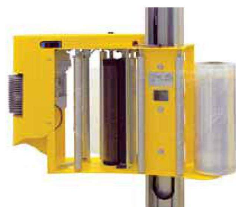
The Power Pre Stretch carriage is driven by belt lift and pre stretch wheels are easy to remove and change.